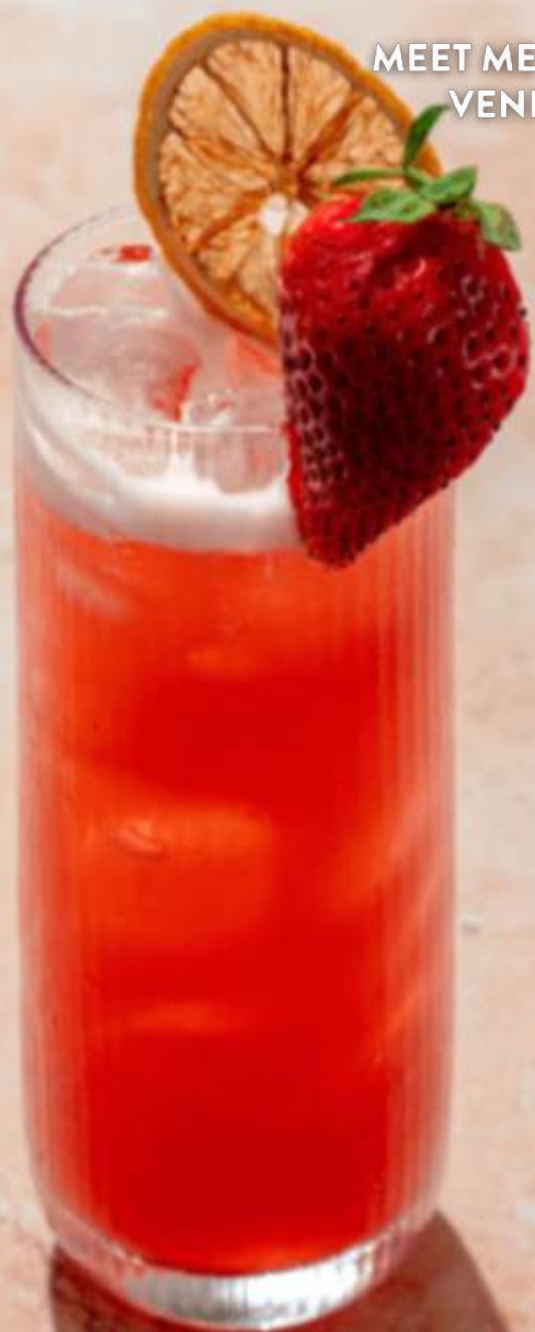
MEET ME IN VENICE