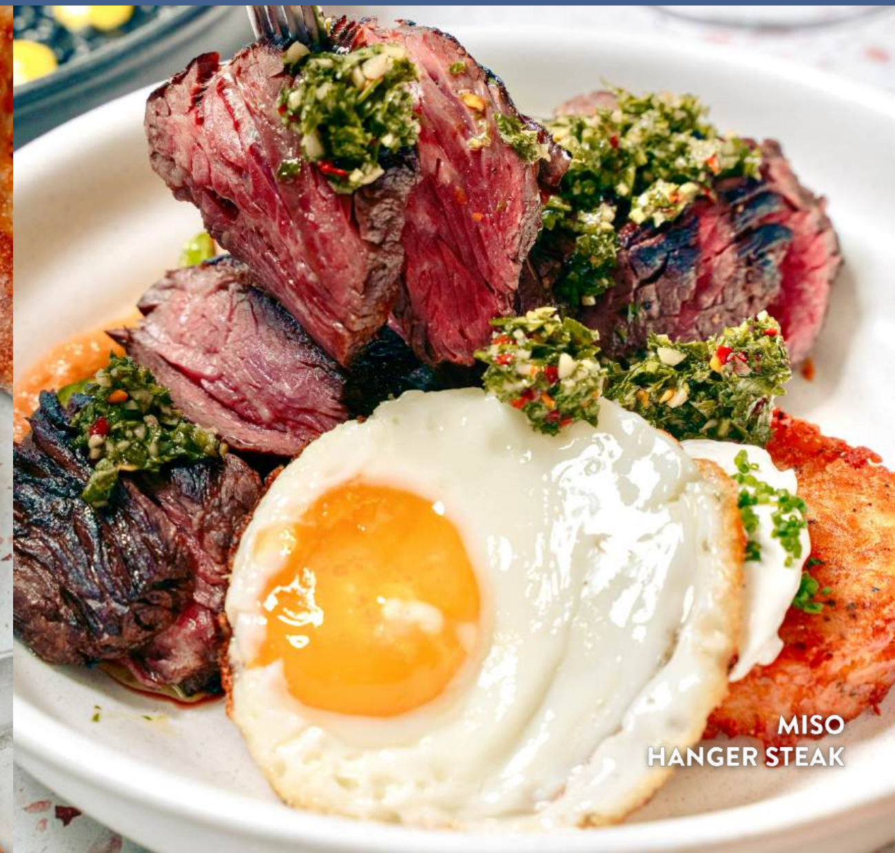
MISO HANGER STEAK