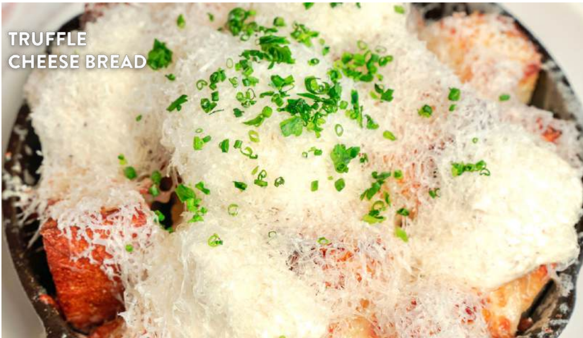
TRUFFLE CHEESE BREAD