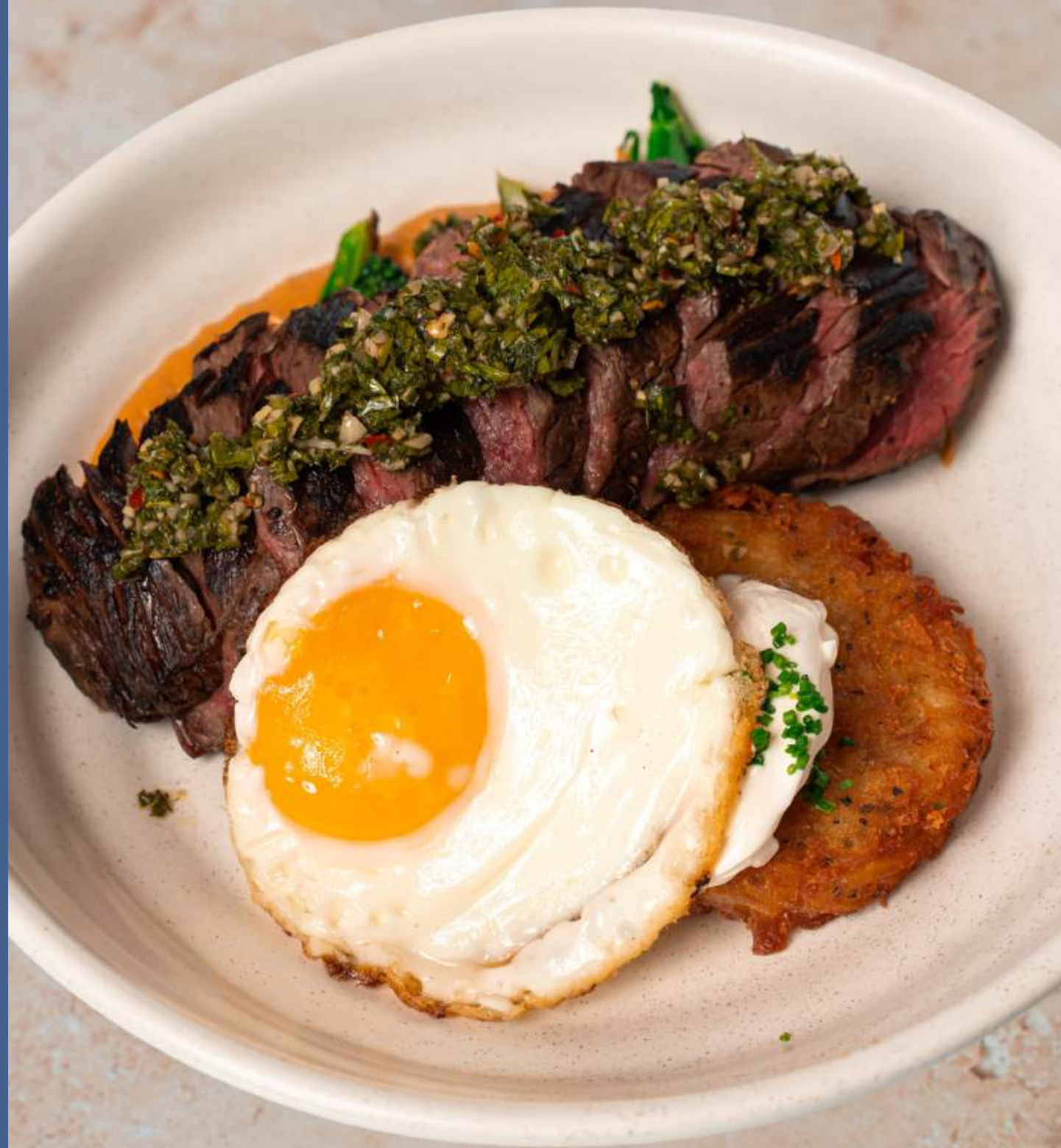
MISO HANGER STEAK

Unless otherwise specified, choose from the INI Lunch Menu. Menu Items are subject to availability. Decorations are subject to prior approval.